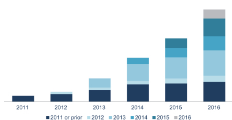
Total Annualized Subscription Revenue by Customer Cohort

We focus on acquiring new customers and growing our relationships with existing customers over time. The chart below illustrates our history of attracting new customers and expanding our revenue from them over time as they realize the benefits of building applications using our software.